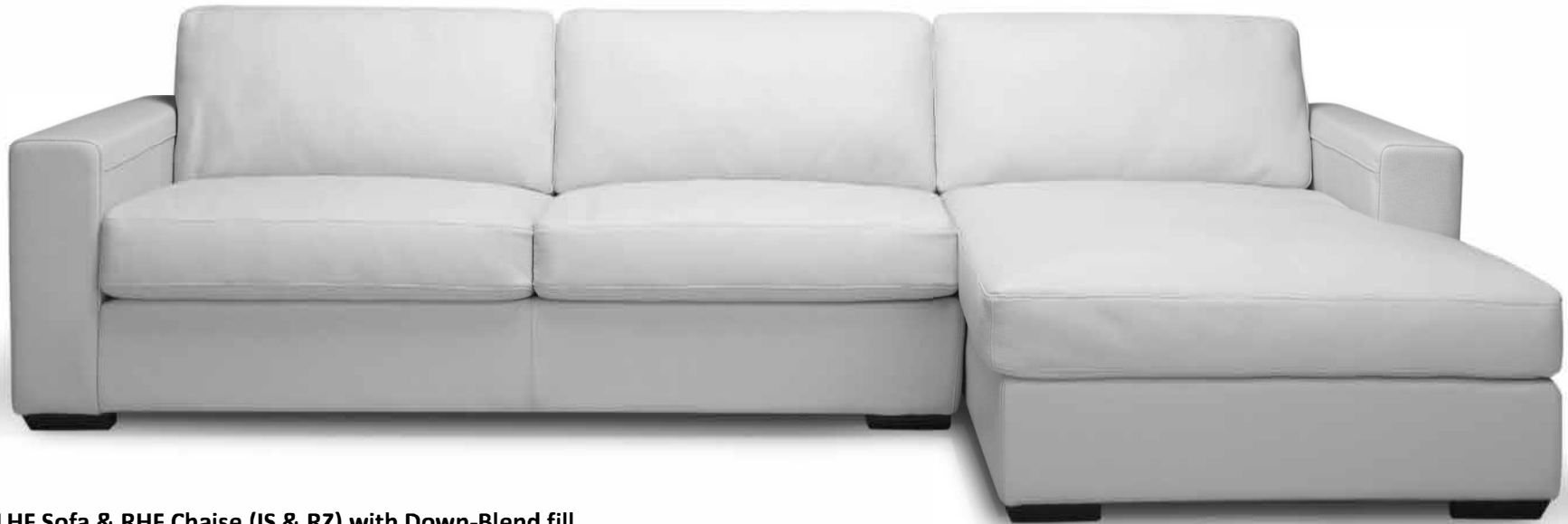
LHF Sofa & RHF Chaise (IS & RZ) with Down-Blend fill

Simplicity with defined lines, attractive and embracing | The categorical intersection of aesthetic & comfort | Modern profile with timeless design | Loose seat & back cushions | Configure sectional to fit your space